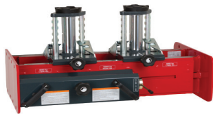
26,400 lb. (12T), 35,200 lb. (16T) & 44,000 lb. (20T) air hydraulic heavy duty jacking beams

Nema 4 water resistant stainless steel control console