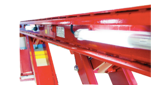
Optional Shatterproof Fluorescent or LED 24V Runway lighting