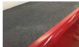
Silica based anti slip runway traction surface