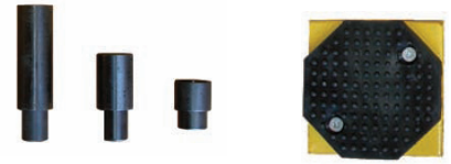
1 1 / 2 " - 4" - 6" Height Adapters Outer Arm Adapter