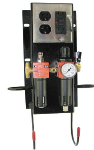
Air - Electric Station