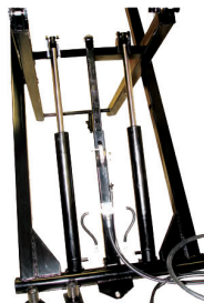
Twin Hydraulic Cylinders Six Locking Positions