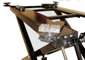
Swing Arms Rubber contact pads 3" & 6" adapters